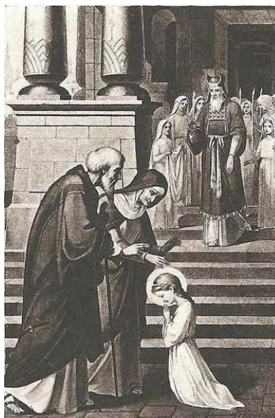
Presentation of the Blessed Virgin Mary